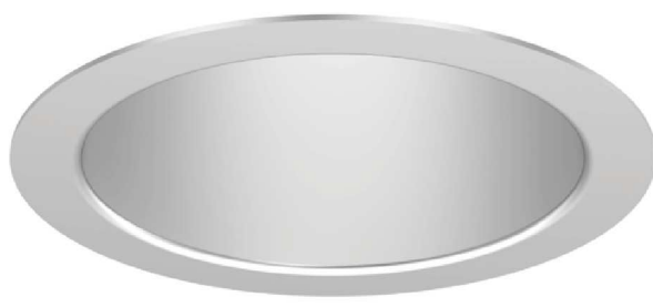
7 RECESSED CANOPY DOWNLIGHT LC1.0 SCALE: N.T.S.